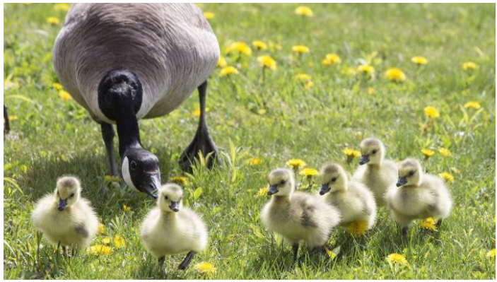
Waterfowl and other wildlife are protected by state and federal laws. Please call rescue professionals if you find any newly-hatched, young, or injured wildlife.

Spring is here and it is baby season for wildlife. This includes waterfowl. Ducks and geese have made their nests and are hatching their eggs. They nest under shrubs, in high grass, up in trees, in your backyards, in parks, and along waterways etc. Not all nests are next to ponds/pools/water. They can be blocks away. If you see a mother duck with her ducklings crossing a street, she is headed to water. Help her by protecting her from car traffic but don't chase her. She knows where she is going and can only go the speed of her babies. If the ducklings are in your pool, put a ramp in for the babies to get out or raise the water level way up to the lip of the pool. They have no protection other than their moms from cold and wet, though they can swim.